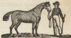
Horse and Boy.